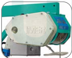
B DRUM TRANSVERSE TO THE MOUNTING BRACKET

The self-energising phenomenon, caused by a current failure during the downward movement at full load, tends to increase the speed up to compromising the hoist and support structure. All our hoists are guaranteed against the phenomenon and always keep