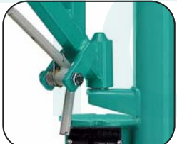
E WORK POSITIONING LEVER The work positioning lever prevents dangerous rotation of the load that occurs during lifting or lowering operations. This device eliminates the risk of uncontrolled movement of the load, reducing risks for the operator and for damage to structures.