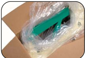
RECYCLABLE PACKING All Imer hoists are packed in cardboard boxes and kept in place by air cushions to prevent damage during transport.