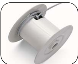
D DRUM WITH TWO FIXED TURNS OF STEEL ROPE

On-site electricity is subject to fluctuations: for this reason the capacity of our hoists is guaranteed for a comprehensive voltage change, from 210V to 235V. A change within these limits does not cause reductions of the hoist capacity.