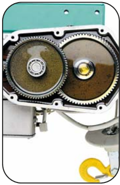
A GEAR-MOTOR WITH GEARS IN OIL BATH

The gearmotor unit is made with helical-toothed steel gears in oil bath. The helical-toothed allows quieter running of the gearmotor, while the use of oil as lubricant offers higher protection and lengthens the life of the machine.